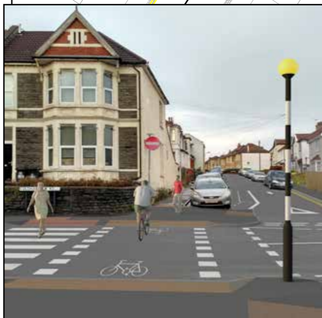
Building out around the junction of Cairns Road will give more space for users.