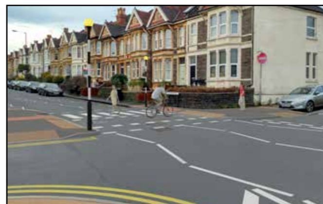
We propose to improve the junction by introducing a parallel pedestrian and cyclists crossing.